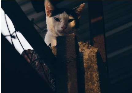
Poor Contrast/Lost Details